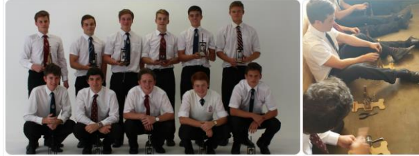
Kersney College Trebuchet Day